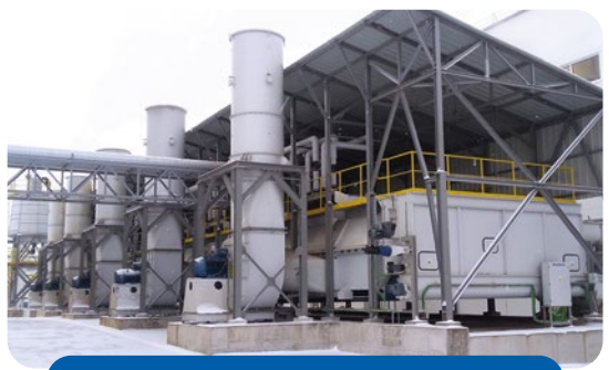
PRODUCTION PLANTS OF 100.000 ton/year

PelletBox by PRODESA combines the reliability and quality of Prodesa's pellet plants with the versatility of a containerized plant.